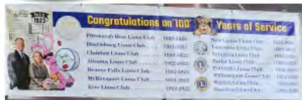
The Altoona Lions also received an award for 100 years of Service!